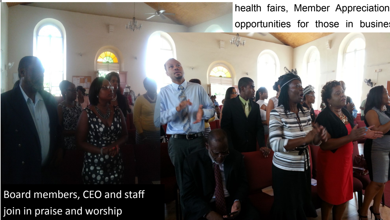
Board members, CEO and staff join in praise and worship

Throughout the week, First Regional recognized and celebrated members through the staging of health fairs, Member Appreciation days and opportunities for those in business to hold