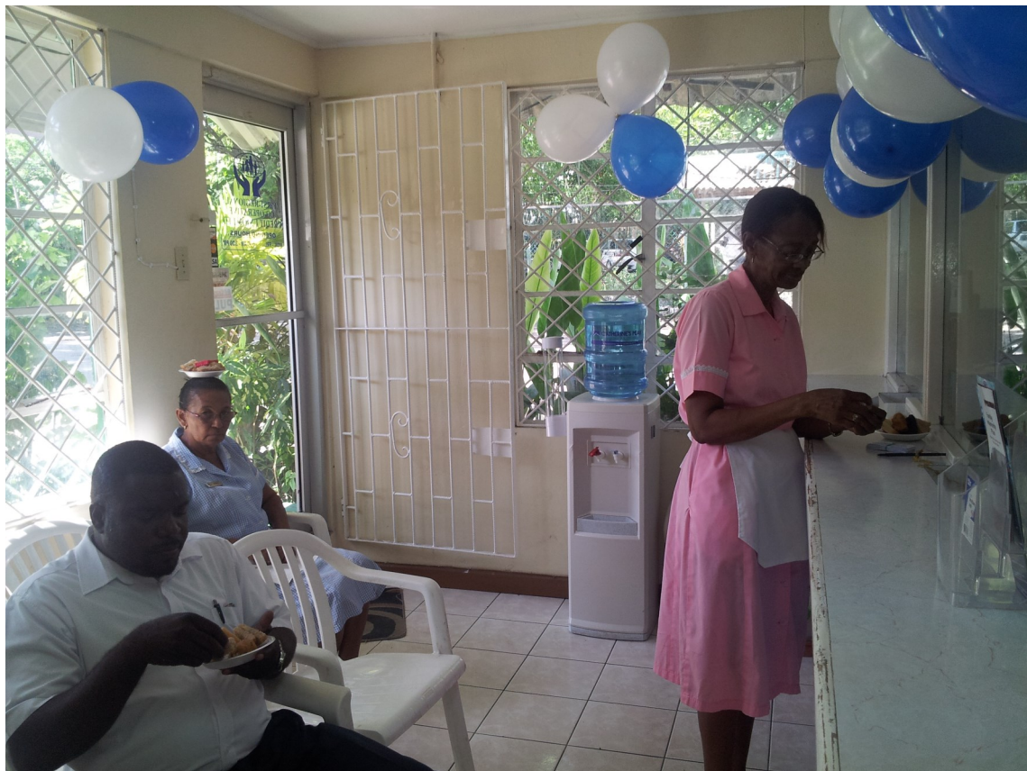
Members at the Round Hill branch on Member Appreciation Day