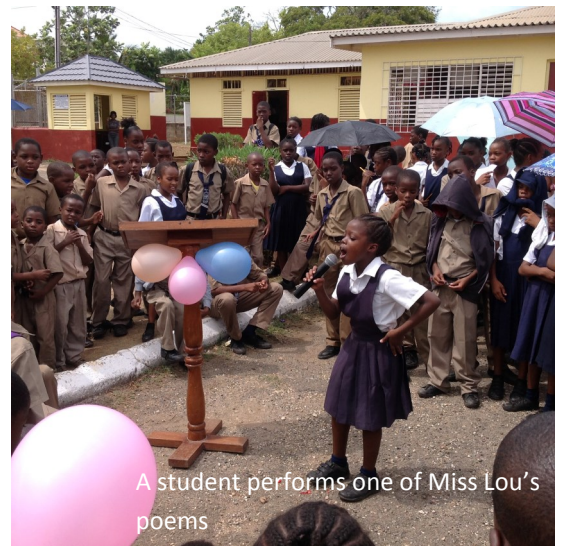
A student performs one of Miss Lou's poems