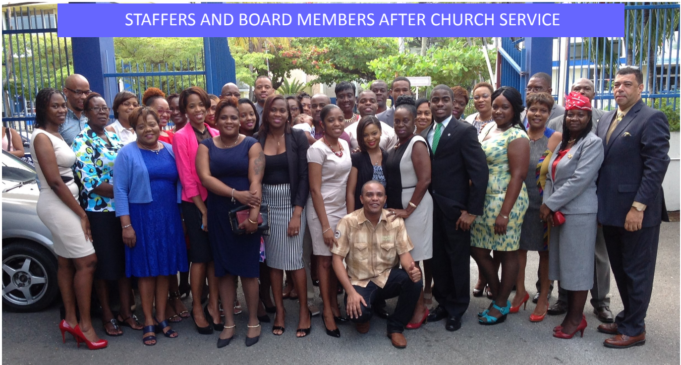
STAFFERS AND BOARD MEMBERS AFTER CHURCH SERVICE

bers said they found the message particularly relevant and engaging. “Even my daughter paid attention right to the end” declared one staff member. “The Church Service provided food for thought, then later there was food for the belly!” quipped another staffer.