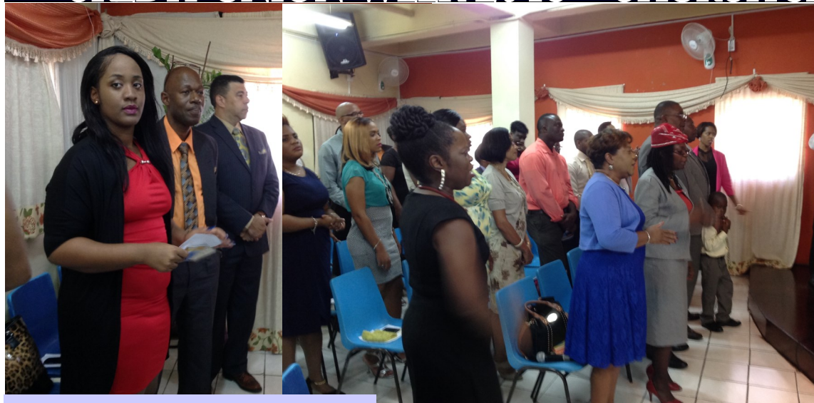
First Regional representatives worship during the October 11 Church Service to launch Credit Union Week